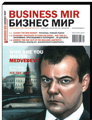
Business Mir n° 10 March / April 2008