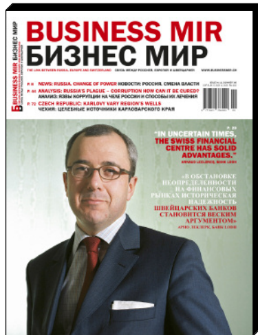
Business Mir n° 11 Summer 2008