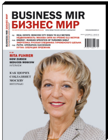
Business Mir n°9 December 2007